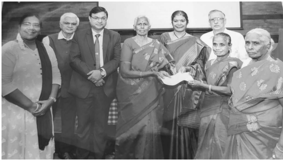
1. IOBIANS 6070: Celebrated “World Elders Day” at Ethiraj College, Chennai on 19th October 2024.