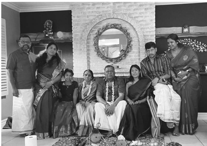
(Celebration of my 80th Birthday in USA)

After Our “World Elder Abuse Awareness Day” Celebration and Our “Annual General Body Meeting on 12th July 2024 at Andhra Chamber of Commerce, Nandanam, I had been to “USA” to spend Our time with my Son and Daughter. We also celebrated my 80th Birthday on 5th October 2024